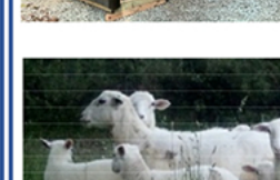
Ram Lambs Only

COWS: 8 Yr. old Jersey family cow A-1 A-2 Due in Oct; Jersey cross family Cow; (both cows are very gentle and would make a good pet)